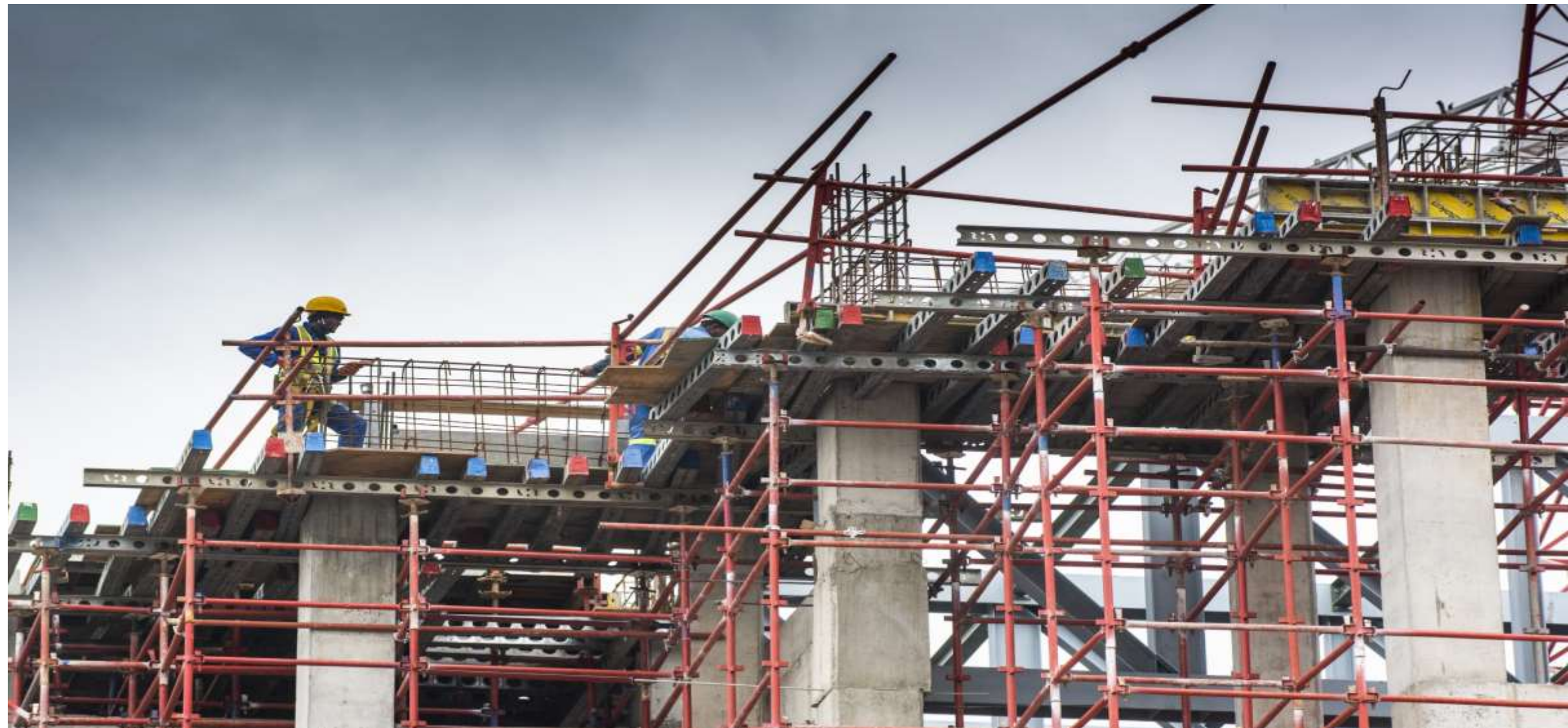
Picture Caption // "Caption here"

Today, AESCO.ltd stands as a testament to our unwavering commitment to excellence and innovation. With a legacy of success and a vision for the future, we look forward to continuing our journey of building excellence, one project at a time.